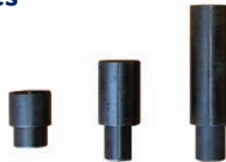
1½" - 3" - 6" Height Adapters