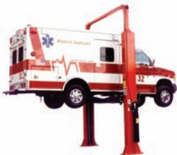
16,000 lb. Capacity SYMMETRIC model 4T216SAR1