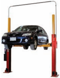
12,000 lb. Capacity SYMMETRIC Model 4T212SAR1