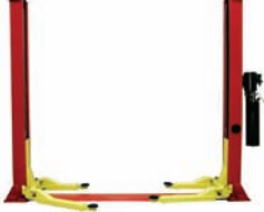
9,000 lb. Capacity Symmetric BASEPLATE Model 4T29BPSR1