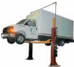
20,000 lb. capacity SYMMETRIC model 4T220SAR1